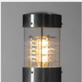
LED, Stainless steel, clear acryl glass