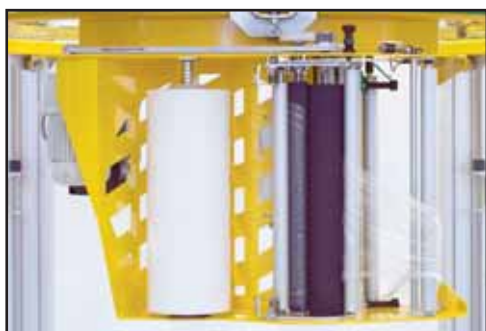
Power Pre Stretch carriage is equipped with one set of PPS gears (150 %, 220 % or 260 %).

Control voltage: 24 VDC Compressed air: 0.6 Mpa, max 9 l/cycle Noise level: < 76 dB (A)