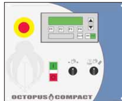
Control panel is mounted on a portable stand.

The company reserves right to make technical changes without prior notification. The machine is illustrated without guarding for sales purposes. Ref. 19GB 10/2004