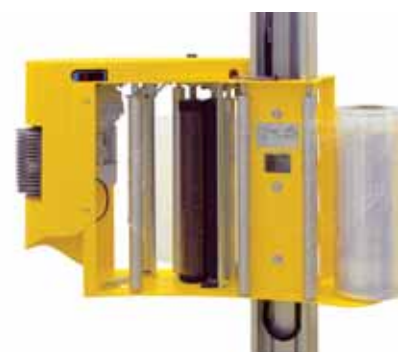
The Power Pre Stretch carriage is driven by belt lift and pre stretch wheels are easy to remove and change.