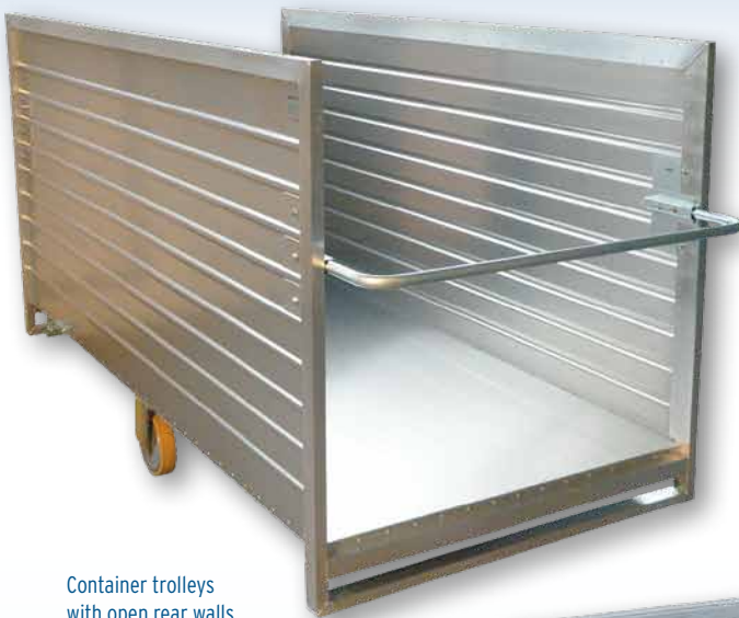
Container trolleys with open rear walls