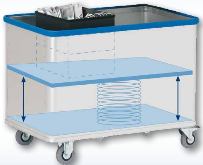
Model D 1408 / 350 - anodised

The load-dependent, freely suspended floor is kept level in special guides in the rear of the trolley. 8 ball bearing rollers keep the movement of the spring-loaded floor exactly level. Smooth walls reduce friction on the load and enable the spring-loaded floor to react immediately to changes in the weight of the load.