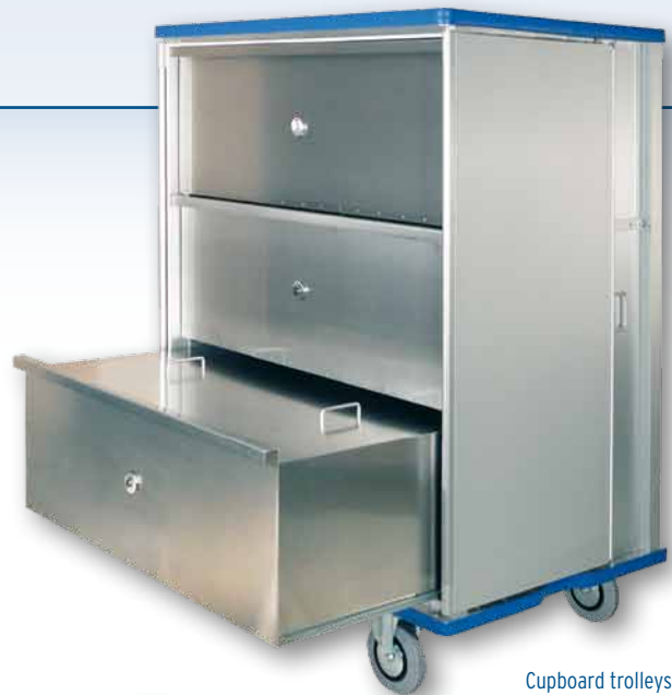
Cupboard trolleys with drawers on telescopic rails