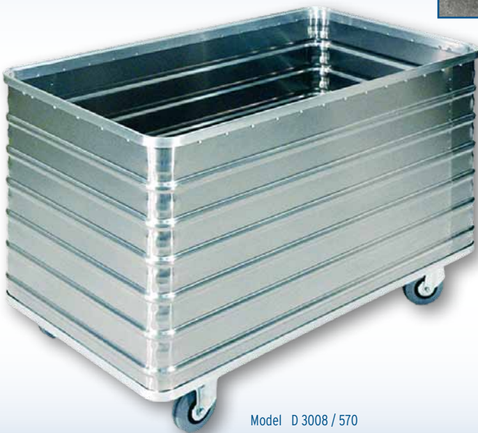
Model D 3008 / 570