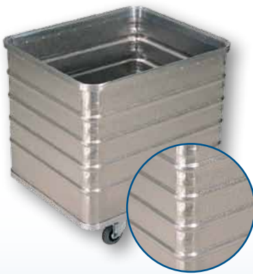
Model D 3008 / 240