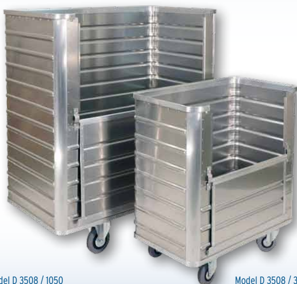
Model D 3508 / 1050