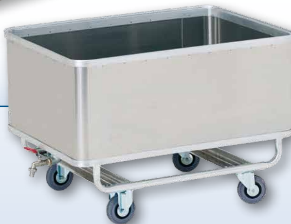
Container trolley water-tight with drain aperture