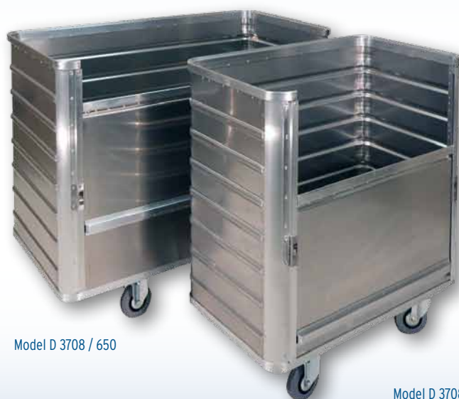
Model D 3708 / 650