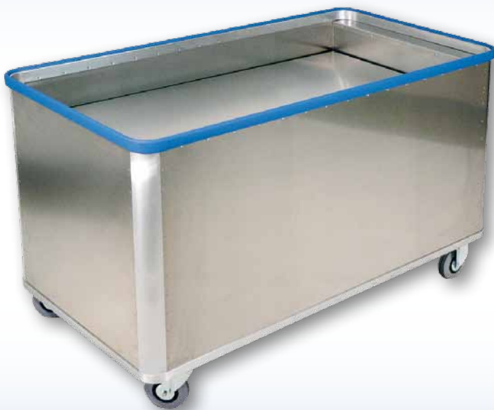
Model D 5408 / 580