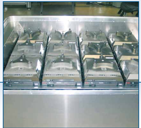
Loaded with engine block components