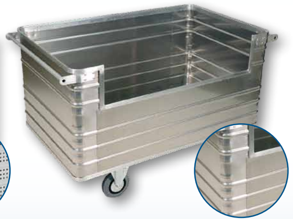
Model D 3808 / 945