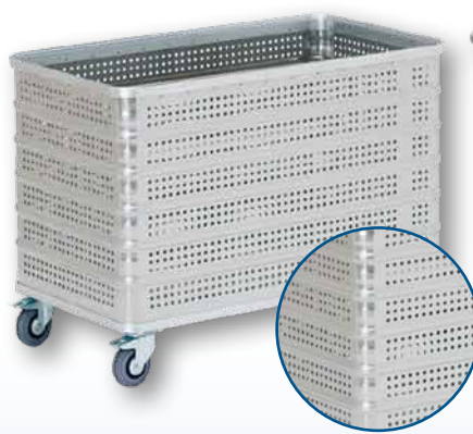
Model D 3008 / 430 P