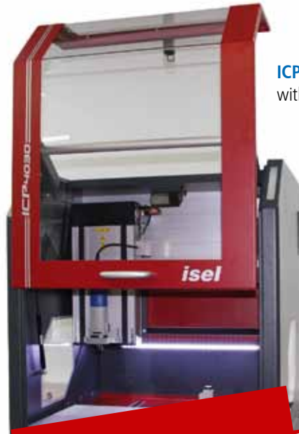
ICP 4030 with hood open