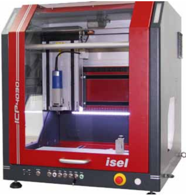
ICP 4030 with hood closed