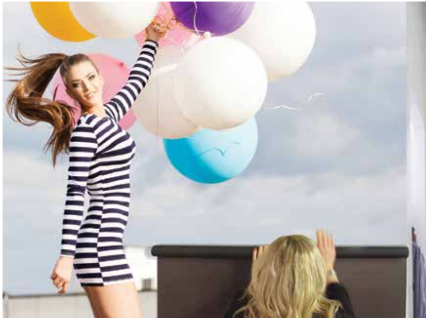
EASY APPLICATION BY INSTORE STAFF