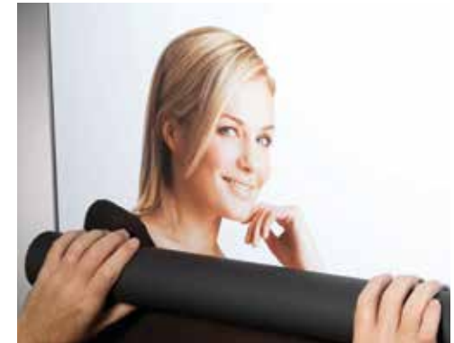
HIGH QUALITY PRINT DEFINITION