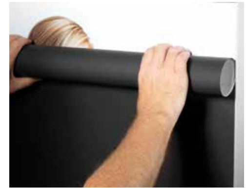
EASILY APPLIED TO THE MAGNETIC FACE

CHANGE IMAGERY IN SECONDS, USING IN-STORE STAFF