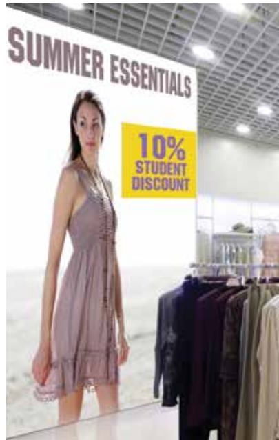
ADD ADDITIONAL LAYERS FOR INSTANT PROMOTION UPDATES