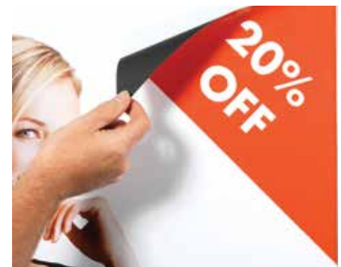
ADD OR MOVE LAYERS QUICKLY AND EASILY