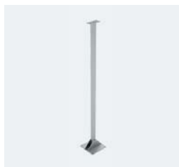
> Stainless steel column for indicator