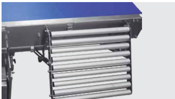
Ref: Contact us