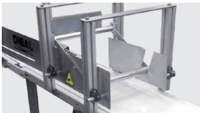
Ref: Contact us