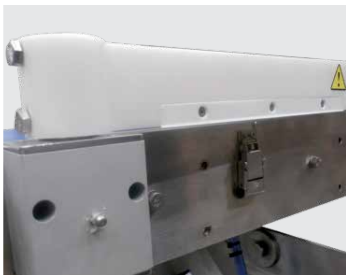
> Other rejection systems (rotating blade)