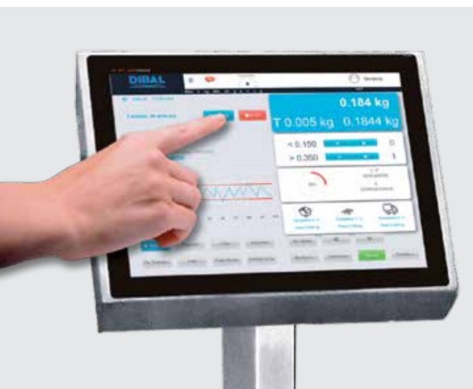
> Touch screen console