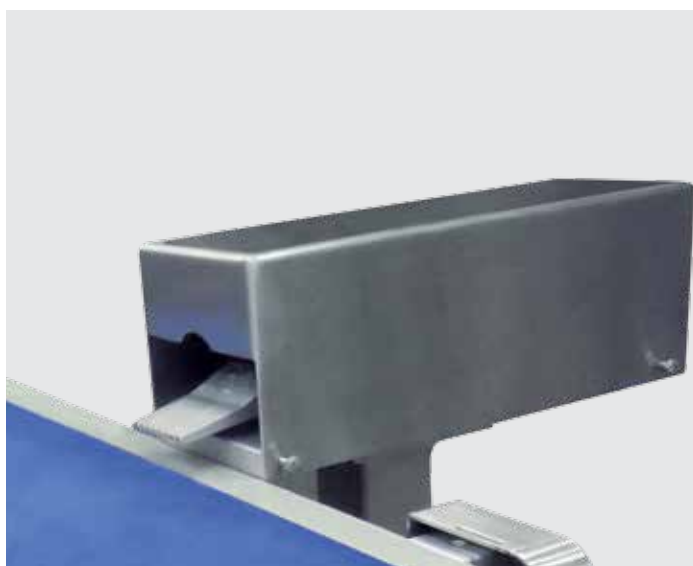
> Other rejection systems ("Air-jet®")