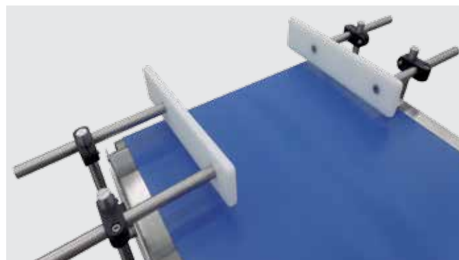
Ref: Contact us