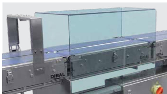
Ref: Contact us

To change the position or orientation of the products.