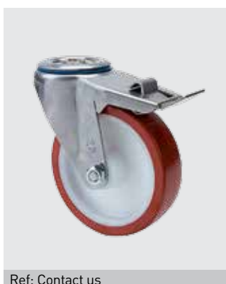
Ref: Contact us

To avoid external disturbances during the weighing process.