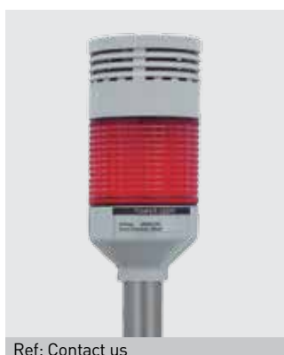
Ref: Contact us