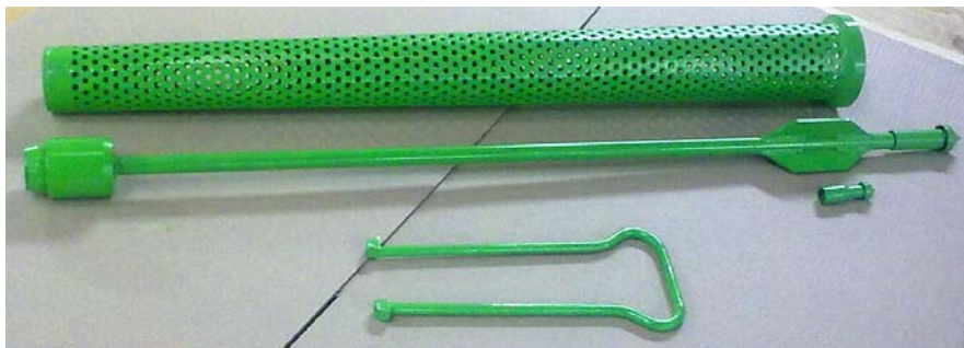
Mud screen for 4 1/2" IF tool joint, with accessories.