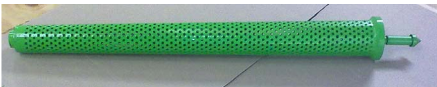
Assembled Mud screen with spear inside