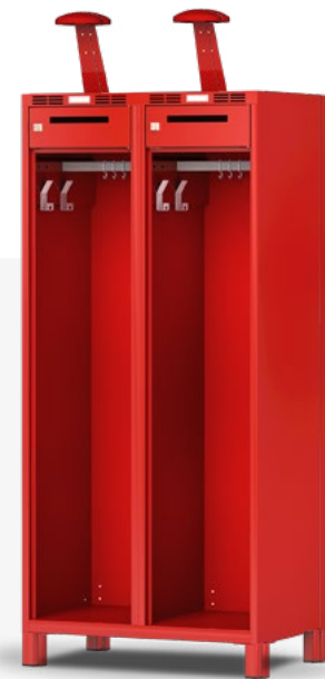
Dimensions HxWxD in cm (without helmet holder)