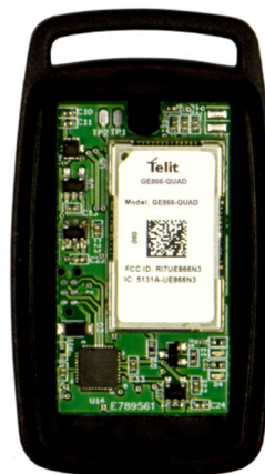
Optional with housing