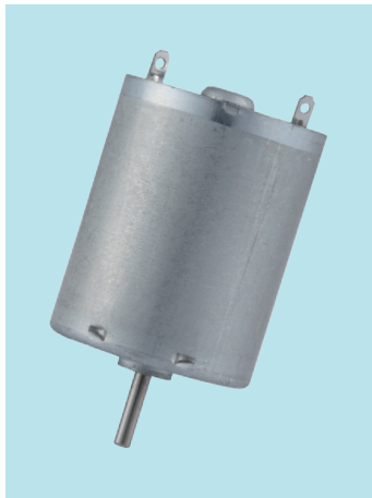
DIRECTION OF ROTATION