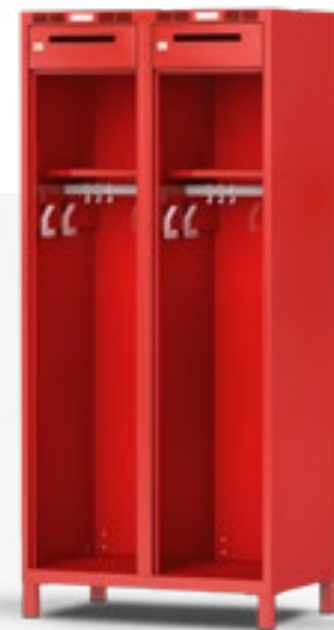
Dimensions HxWxD in cm